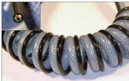
Bonded with Wire