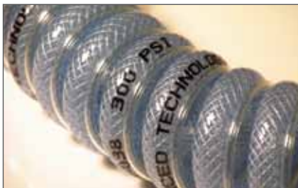
Bonded with Tubing