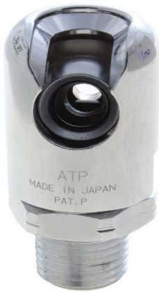
Safety Slide™ Premium Safety Couplings