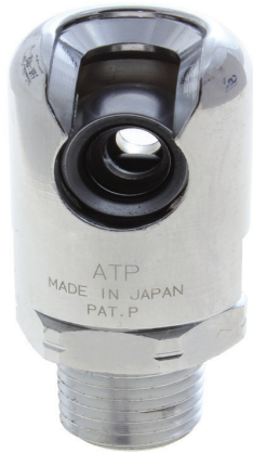
Safety Slide™ Premium Safety Couplings